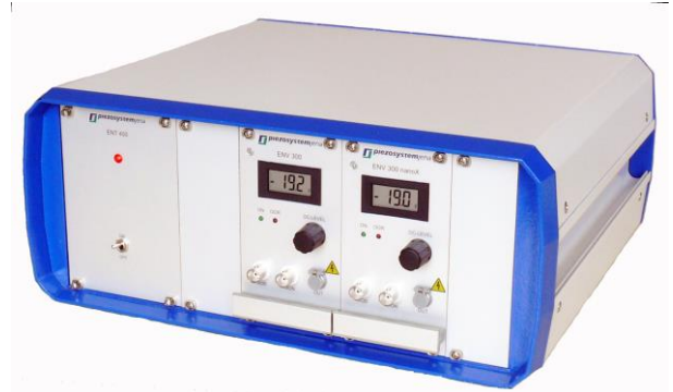
pic. 1: ENV system based on 63TE table top casing