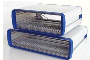
pic. 4: table top casings 63TE and 84TE