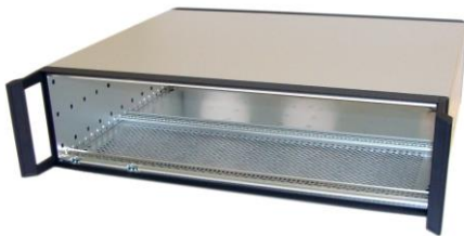
pic. 3: casing design 19"rack mount version

*** casing 84TE 19"-rack mount system, 375mm depth, comes with integrated high power main supply module (90V-265V), there is no need for a separate ENT module.