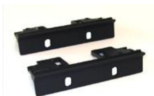
pic. 5: L-brackets for 19-rack mount casing E-103-921