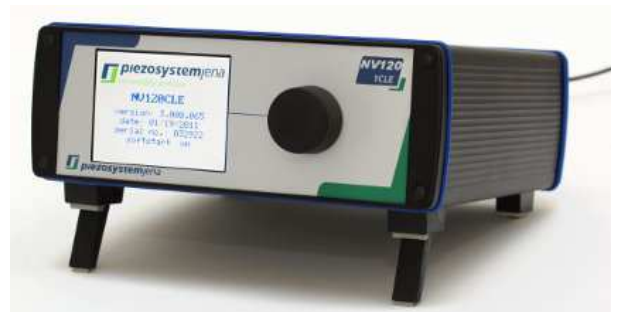
image: NV 120/1 CLE

Various control interfaces are available. There is an analog interface that can be controlled by 0 to 10 V, RS 232, and USB 2.0 interface. The digital interfaces have a resolution of 16 bit. An analog monitor output shows the control voltage of the piezoelectric actuator in a fixed ratio, completing the technical advantages of the series NV 120/1.