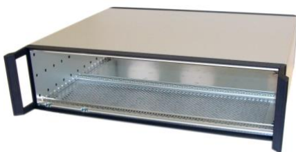
pic. 3: casing design 19"rack mount version

*** casing 84TE 19"-rack mount system, 375mm depth, comes with integrated high power main supply module (90V-265V), there is no need for a separate ENT module.