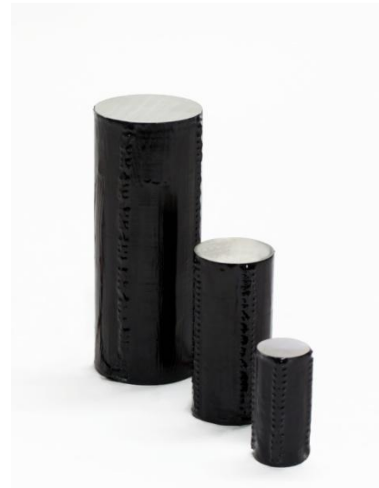
Image: Stack type actuators with different diameters and length