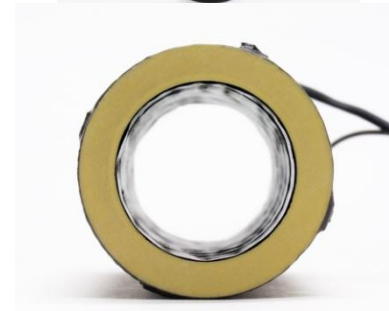
Image: Ring type actuators with different dimensions